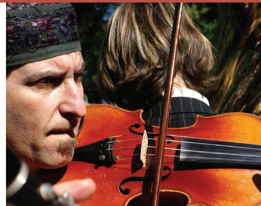
Yale Strom Improvisation